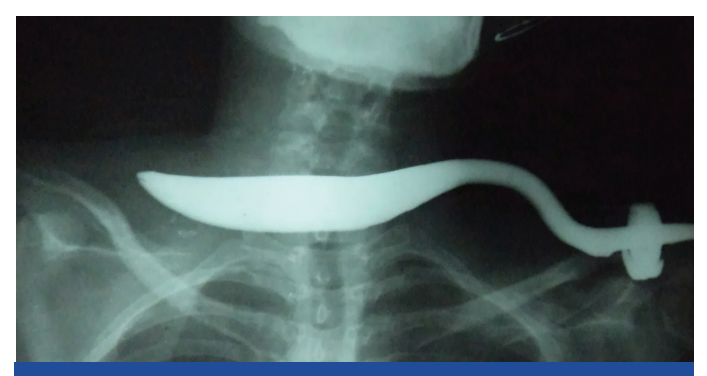
[Table/Fig-2]: Cervical radiograph showing, a pointed foreign object penetrating the neck at C4/C5, crossing the midline to reach up to right supra-clavicular fossa. Note tracheal deviation towards right side.